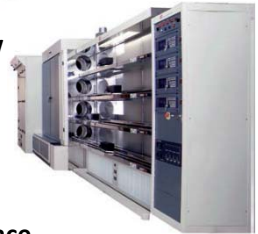
Horizontal Diffusion Furnace