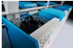
ALD (Atomic Layer Deposition)