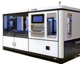
Furnace Automation & Wafer Handling Systems