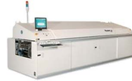
In-line Reflow Ovens